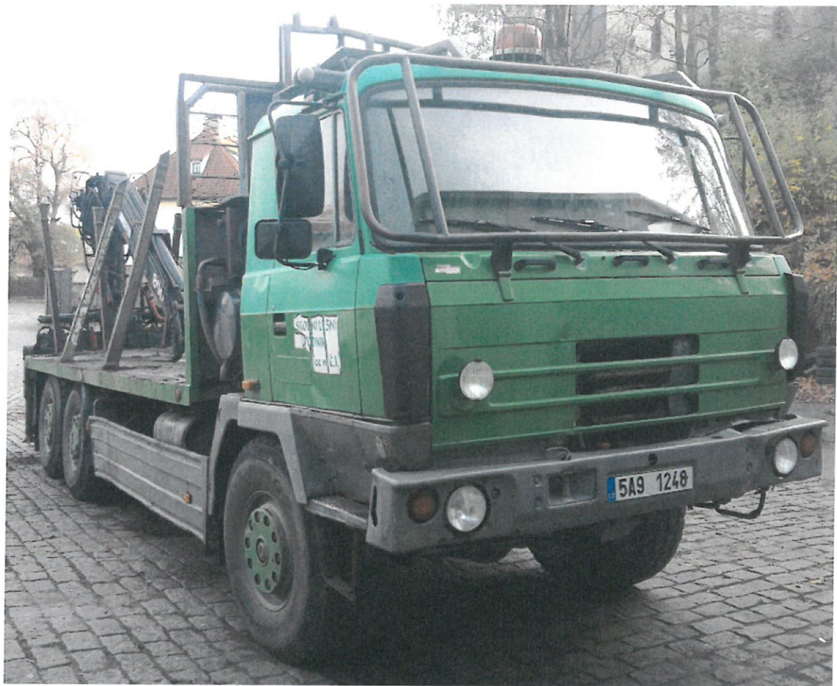
App:nr. 1 – photographs